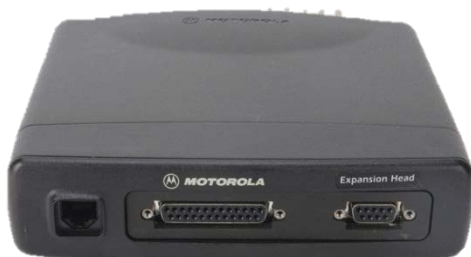
MTM700/800 with Expansion Head