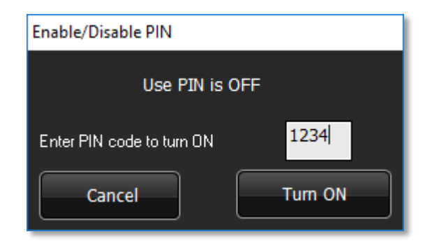
PIN code menu