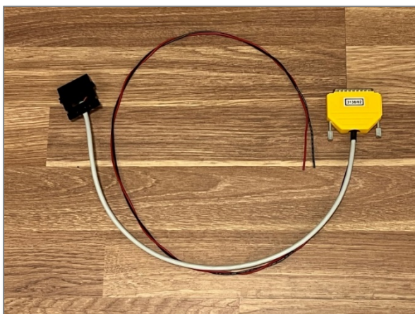
Cable Kit 3138/02 MotoTrbo without Virtual Control Head

The network interface consumes max 0,3A.