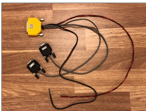
Cable Kit 3214

The network interface consumes max 0,3A.