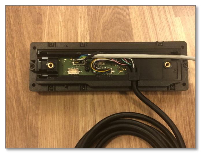
Connection at the back of the control head