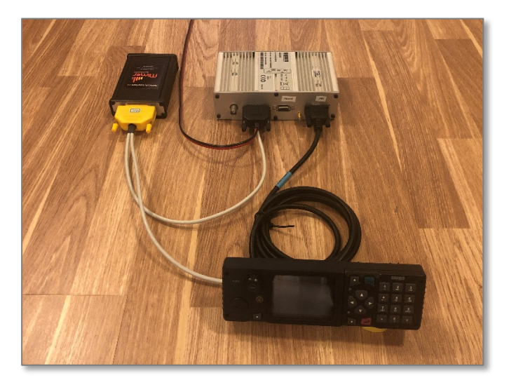
Fully connected kit