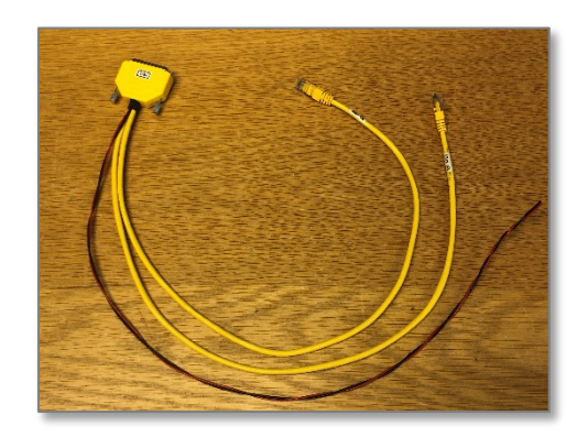
Cable Kit 3268

The interface shall be powered with 12VDC through the red and black wires. Red is positive.