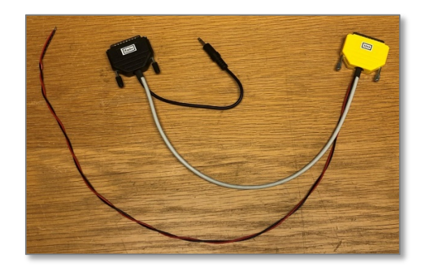
Cable Kit 3274

Connect the 3,5mm audio connector to the radios external speaker output.