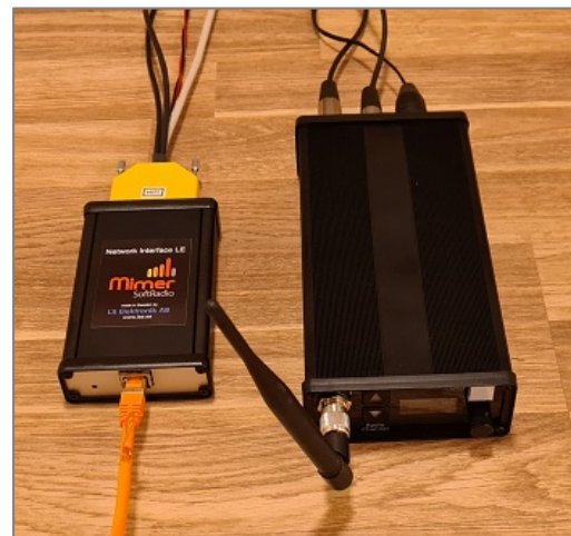
Vokkero “WI” 4-Wire Interface with network interface 3009/09 and 3130