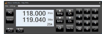
Virtual Control Head for Trig TY92

This cable kit will together with the Mimer Network Interface give remote control of the radio's audio and PTT functions.