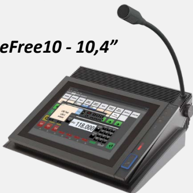
BeFree10 - 10,4"